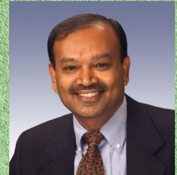
Meyya MEYYAPPAN NASA, USA